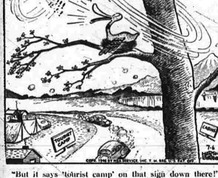
"But it says 'tourist camp' on that sign down there!"